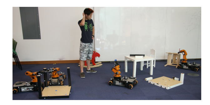
Fig. 1. A robot engaged in assembling an IKEA LACK table requests help using natural language. A vague request such as "Help me" is challenging for a person to understand. Instead, this paper presents an approach for generating targeted requests such as "Please hand me the black table leg."

Generating natural language requests for a robot is challenging because the robot must map from perceptual aspects