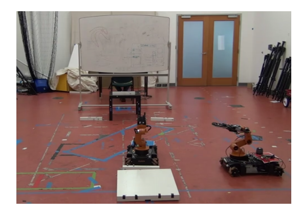
Fig. 8. Initial configuration for the user study. The user is seated behind the whiteboard in the background.

After communicating a help request, the robots waited up to 60 seconds for the user to provide help. If the the environment